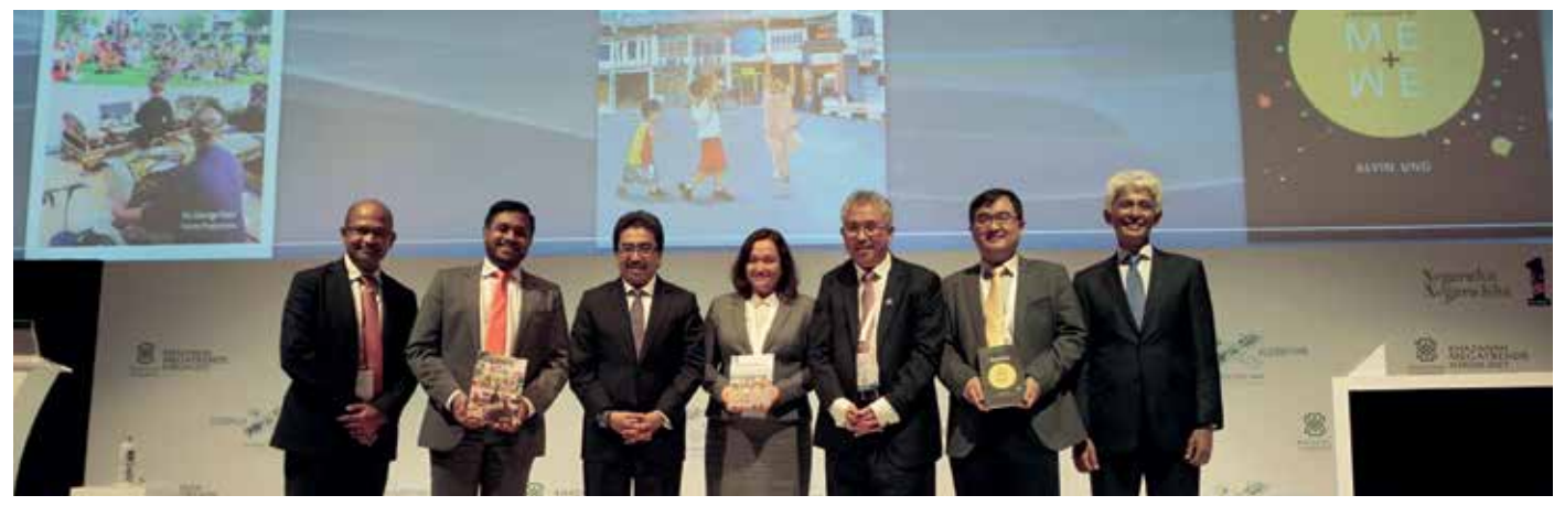
Three publications were launched at this year's Khazanah Megatrends Forum:

Rejuvenating the City Together by Think City – a book which talks about Think City's challenges, successes and shortcomings in managing its pilot public grant programme in the George Town UNESCO World Heritage Site.