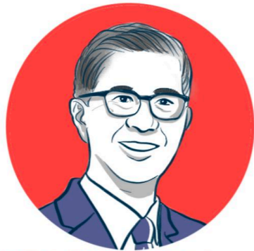
YB SENATOR TENGKU DATUK SERI UTAMA ZAFRIUL TENGKU ABDUL AZIZ MINISTER of INVESTMENT, TRADE & INDUSTRY MALAYSIA

KALAU KITA NAK PERUBAHAN KITA PERLU LEPASKAN KEBENCIAN!