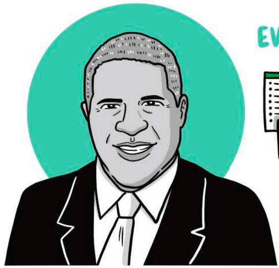
Robert F. Smith FOUNDER, CHAIRMAN & CEO, VISTA EQUITY PARTNERS