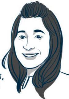
SENIOR VICE PRESIDENT, RESEARCH, KHAZANAH NASIONAL BERHAD